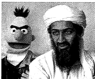
Fig. I.1. Dino Ignacio's digital collage of Sesame Street 's Bert and Osama Bin Laden.

CNN reporters recorded the unlikely sight of a mob of angry protestors marching through the streets chanting anti-American slogans and waving signs